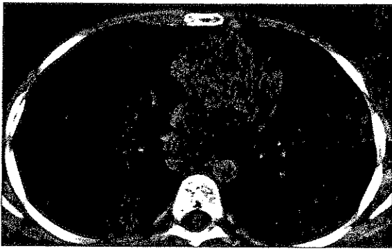
Figure 1 - Abscess in the posterior esophageal wall.