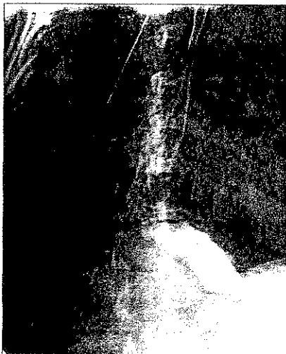
Figure 3 - Complete healing after 15 days, with mild irregularity.

was left in place and a naso-gastric tube was inserted. The postoperative course was uneventful. Due to the large size of the perforation, solid oral feeding was postponed for 2 weeks (Figure 3). Follow up for more than one year by upper gastrointestinal series and endoscopies showed adequate healing without any stricture.